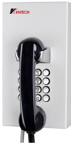
Analogue KNZD-05 Emergency Phone